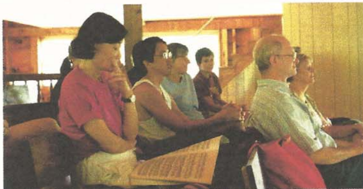
Studying a score at Kinhaven Piano Workshop in Vermont

23-30 August Location: Lenox, Massachusetts www.artsahimsa.org www.belvoirterrace.com Set at a beautiful 19th-century estate, ArtsAhimsa promotes non-violence throughout the arts. Chamber music classes for pianists and string players.