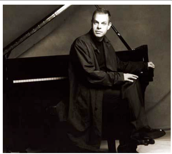
Jazz pianist returns to Princeton to perform in the Golandsky Institute International Piano Festival.

In its fifth season, the Golandsky International Piano Festival offers a week of music by masters of the keyboard. Friday, July 11, 2008 2:21 PM EDT By Susan Van Dongen