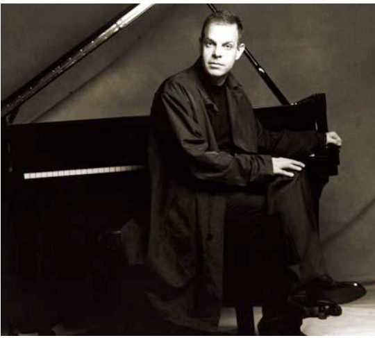
Jazz pianist returns to Princeton to perform in the Golandsky Institute International Piano Festival.

Friday, July 11, 2008 2:21 PM EDT By Susan Van Dongen